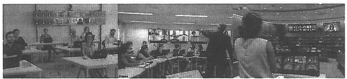
Figure 2: Generic visual examples of HyFlex classroom spaces and teaching environments.

No; new faculty will have an office in Felmley Hall or Felmley Annex. Instruction is online or existing inperson classes. Classroom maintenance costs for recording or live sessions is supported through operating/donor/FCR funds in the proposal above. However, an initial cost of $80k is needed to create a HyFlex classroom in the Felmley Hall of Science Annex. Generic examples are shown below in Figure 2.